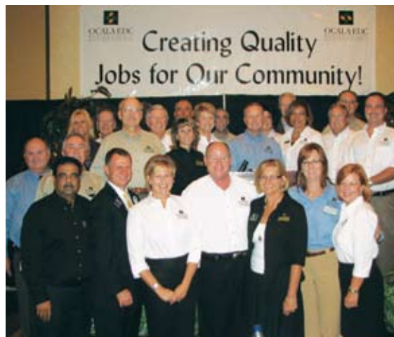
2009 EDC Board of Directors