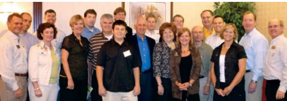
Marion and Alachua Counties partnered with Progress Energy for the Fifth Annual Site Consultants Weekend in September 2009. Site consultants from across the nation gathered with the Heart of Florida team for a "Welcome Breakfast" at the Hilton Ocala.