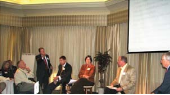
Economic Growth Summit – During turbulent economic times, the EDC took a pro-active approach and held the Economic Growth Summit, which yielded twelve action steps to help position our community for economic recovery.