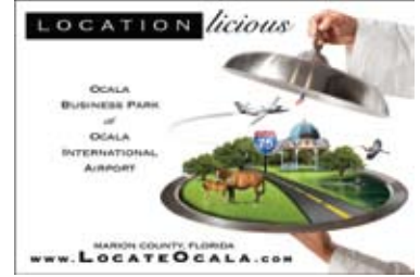
The EDC is embarking on an aggressive marketing campaign to promote Ocala/Marion County as an excellent place to bring or expand businesses and create quality jobs.